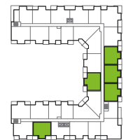
SECOND - FIFTH LEVEL