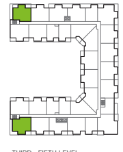
THIRD - FIFTH LEVEL